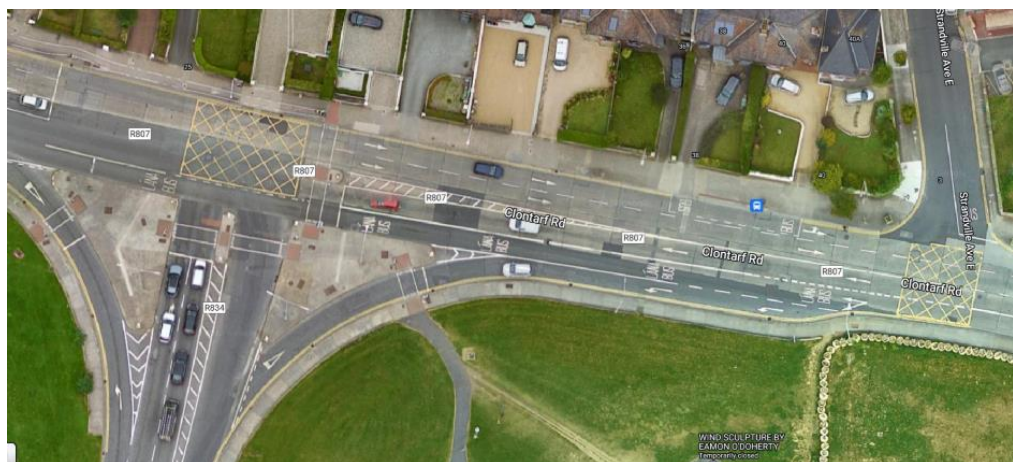
Fig. 1 – Clontarf Rd/Alfie Byrne Road Junction Pre C2CC Scheme

Figure 1 (as per below) illustrates the junction arrangement at the Alfie Byrne Road which existed prior to the C2CC Scheme commencing. With this configuration, whilst travelling inbound and arriving at the end of the coastal cycle-track a cyclist was then required to cross (i) the left hand slip from Clontarf Rd onto Alfie Byrne Rd (ii) the Alfie Byrne Road itself with inbound and outbound lanes and (iii) the left turn slip from Alfie Byrne Road onto Clontarf Road. Similarly when travelling outbound in order to access the coastal trail, cyclists were required to cross the Clontarf Road, and then the left turn slip from Clontarf Road onto Alfie Byrne Road. Pedestrians and other vulnerable road users were required to complete these multiple crossings also in order to get from one side of the road to the other.